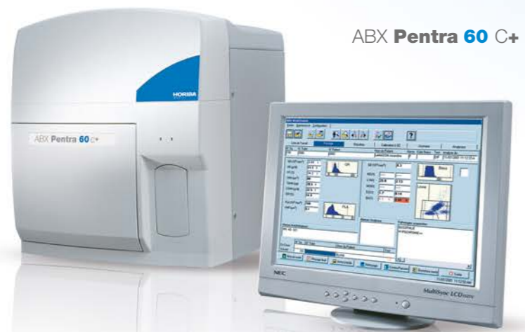
ABX Pentra 60 C+