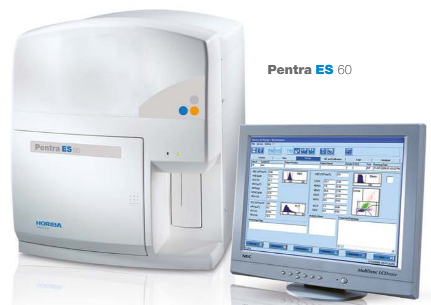
Pentra ES 60