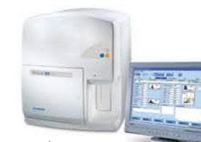
Pentra ES 60