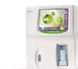
ABX Micros ES 60