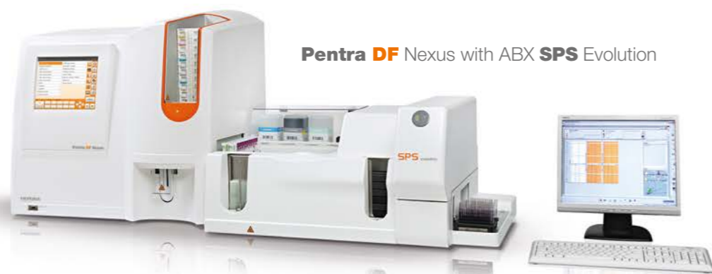
Pentra DF Nexus with ABX SPS Evolution