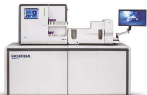
Yumizen H2500 Yumizen SPS