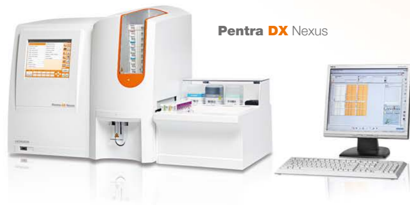
Pentra DX Nexus

120 tests/hour 50 parameters Expert validation system (ABX Pentra ML)