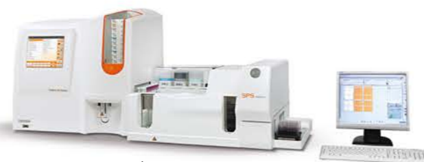
Pentra DX Nexus SPS Evolution