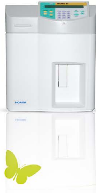
ABX Micros 60